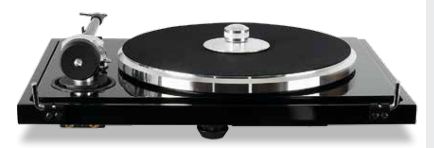
ABOVE: The B-Note arm's counterweight is damped by a soft TPE polymer while the nylon thread for the bias outrigger connects into the base of the bearing. The tonearm cable RCAs, ground post and PSU socket are all located under the deck

Simply The Best [Parlophone 0190295378134]. Her remake of 'Nutbush City Limits', while not a patch on the original, still exudes power and the woman is incapable of whispering even when performing a love song. This track, as well as the revamped 'River Deep, Mountain High', is a cornucopia of sounds, the kind of recording which suits a quickie demo in a hi-fi store on a Saturday afternoon because it lacks only the kitchen sink.